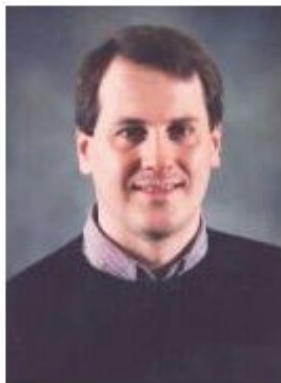
Figure 1—A JPEG image of the author.