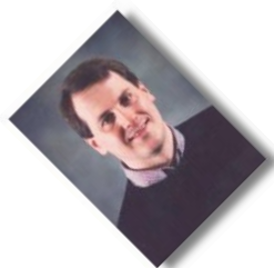
Figure 2—Image of the author scaled by 0.5 and rotated by 45°.