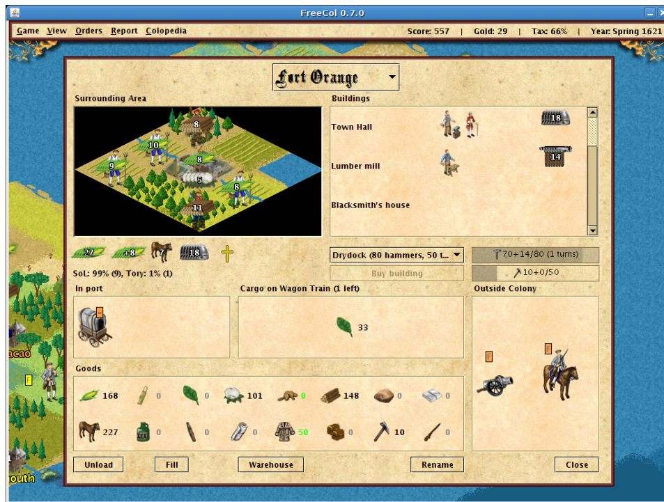
Figure 3: The Colony Panel

Below the list of buildings, you can see four elements related to the production of buildings and units. At the top left, a select box allows you to select the building or unit you wish to build. The button at the bottom left allows you to buy the selected building or unit instead of building it. The two progress bars to the right show you how many hammers and tools are required to finish the selected building or unit, how many hammers and tools you have already produced, how many will be produced in the next turn, and how long it will take until all necessary goods have been produced.