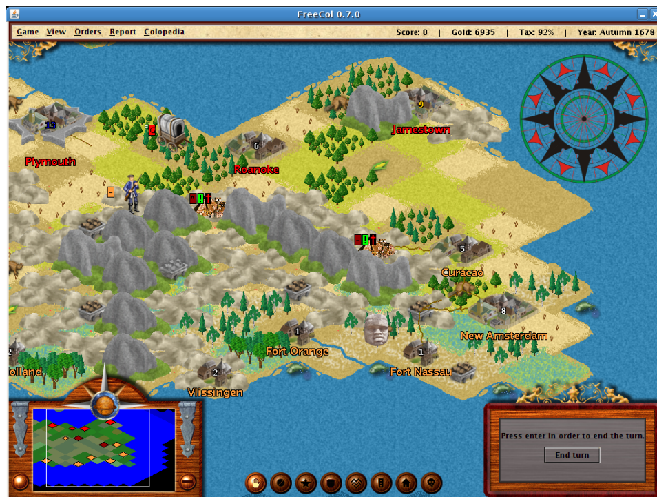
Figure 1: The main screen.

The figure 1 represents the main screen.